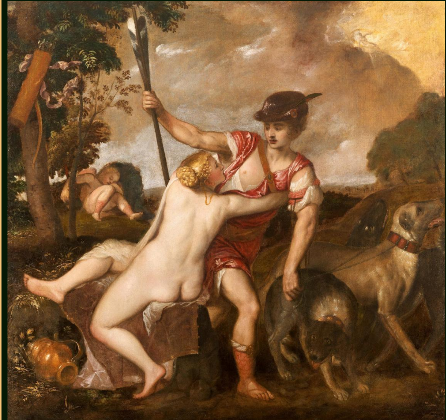
Venus & Adonis , Titian’s interpretation of Ovid’s Metamorphoses