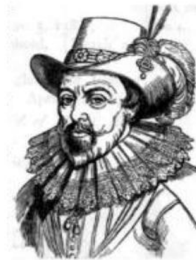
William Stanley, Sixth Earl of Derby

In the following, I hope to provide a reasonable summary of the evidence that I believe points to William Stanley, the sixth earl of Derby, as the author of the works generally attributed to Shakespeare. I do not intend, of course, to present all the material here, but do hope to give a reasonable history of the Derbyite conviction, and in so doing point to some of the sources, compilers, and interpreters of this information, and then bring it up to date with recent discoveries and publications. Beginning with the referenced works, I believe the interested reader will find much to flesh-out the skeleton sketched here.