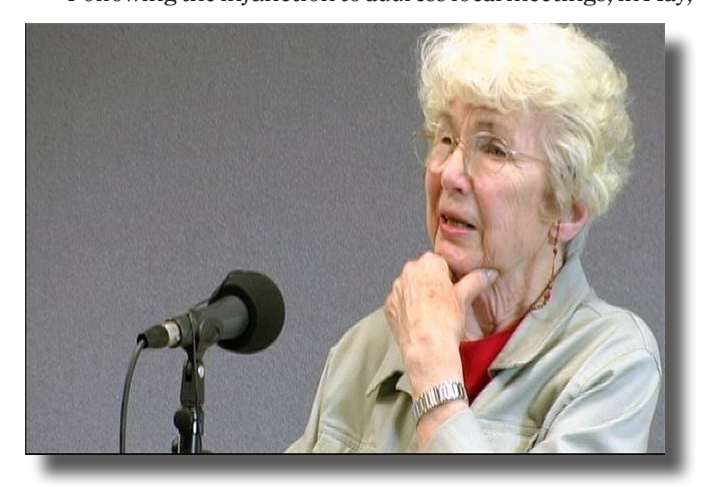
Sharpe in Port Townsend.

Following the injunction to address local meetings, in May,