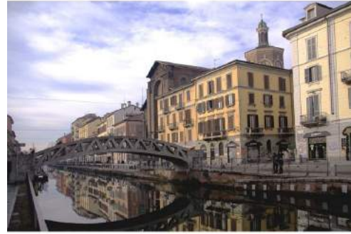
Canals in modern Milan. In the 16th century the city was a bustling port.

to investigate something that should have been researched generations ago by academicians: confirm or refute the accuracy of the allusions to Italy in Shakespeare's plays. Using contemporary and modern sources, The Shakespeare Guide to Italy demonstrates that all the references to Italian language, culture and geography in at least ten plays are or were accurate. Impossible to travel to Milan by water? The city was totally water-locked until the 20th century: the most convenient way to reach it in the 16th century from any part of Italy was by barge through a series of interconnected canals. There never was an Emperor of Milan? The Emperor Charles V