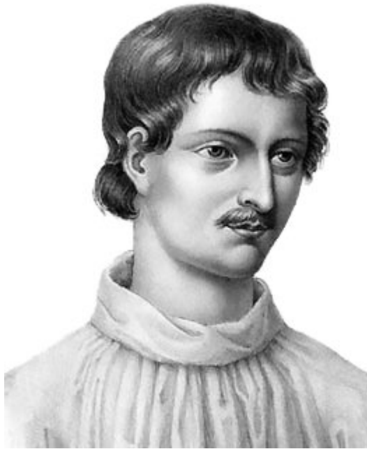
Giordano Bruno, 1548-1600