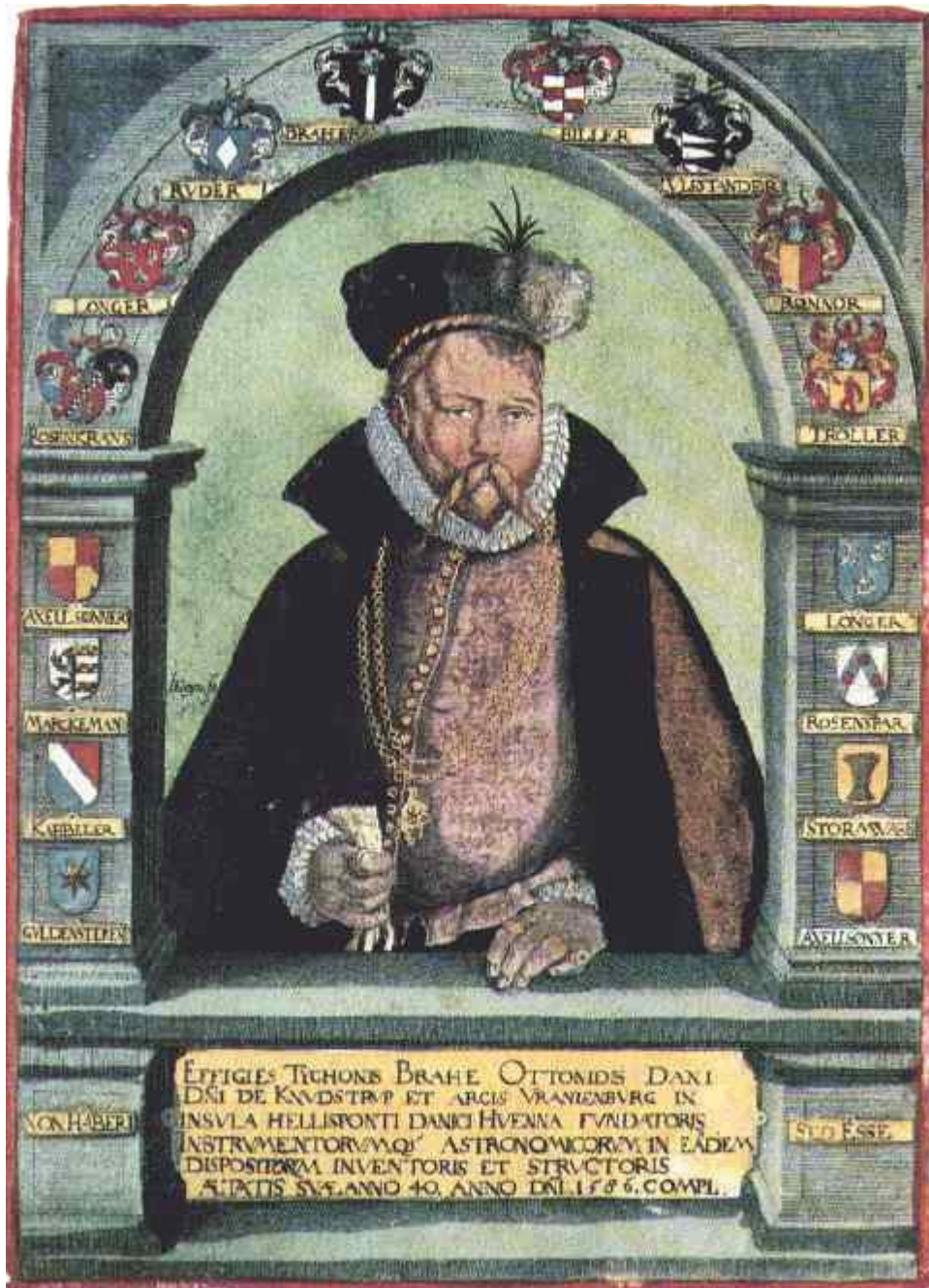
Tycho Brahe surrounded by the arms of his noble ancestors, including (clockwise from bottom), Gyldenstjerne and Rosenkrantz .