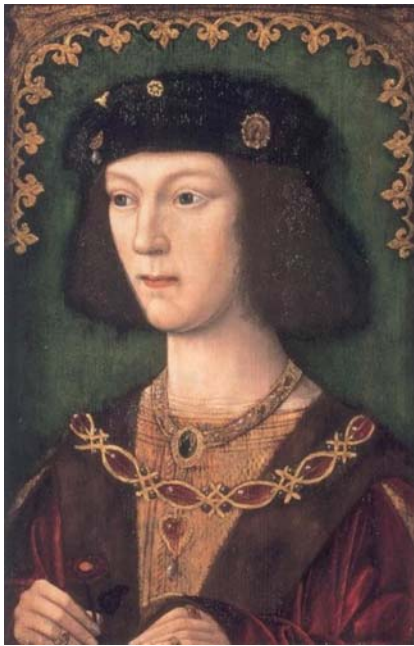
Henry VIII Coronation Portrait

had an estate that could furnish a ship, or son capable of commanding one, the narrow seas should not be infested.” 17