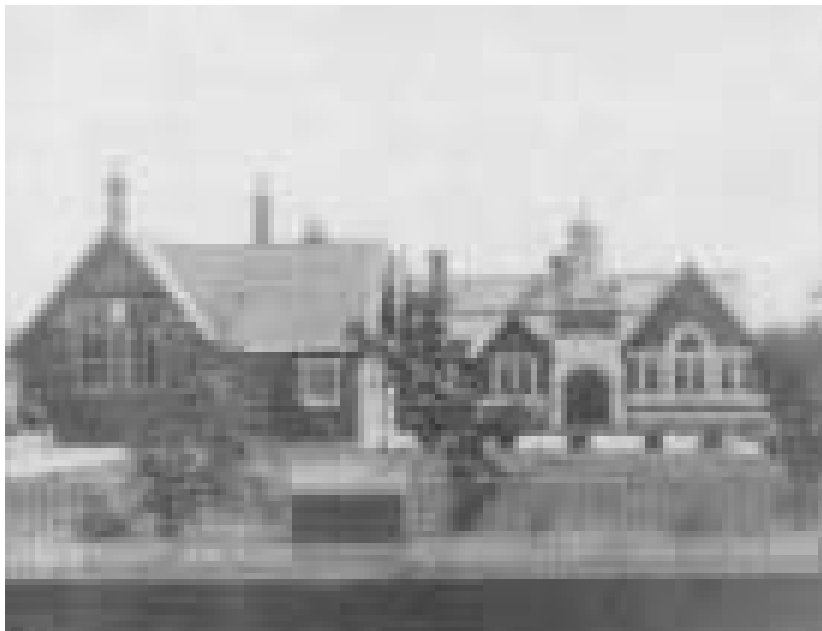
Earls Colne Grammar School, 1520