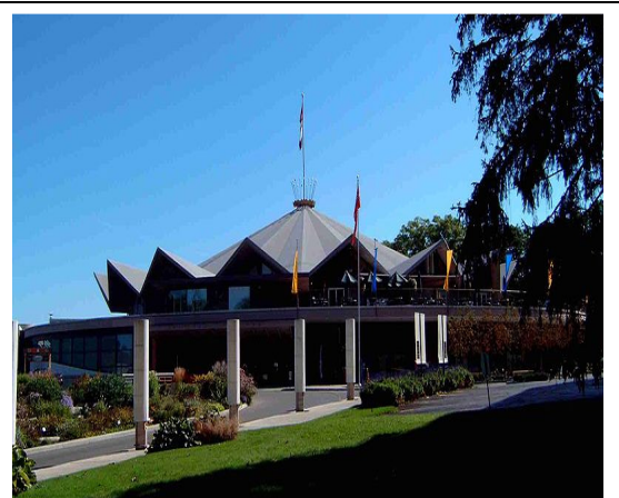
Shakespeare Festival Theater

The Festival Theatre, designed to resemble a tent in memory of those first performances,